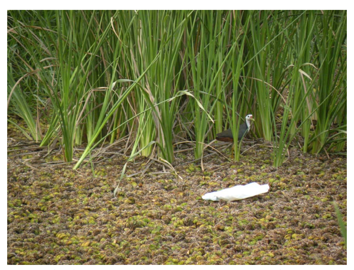
Do not bother me much, I am least concerned!