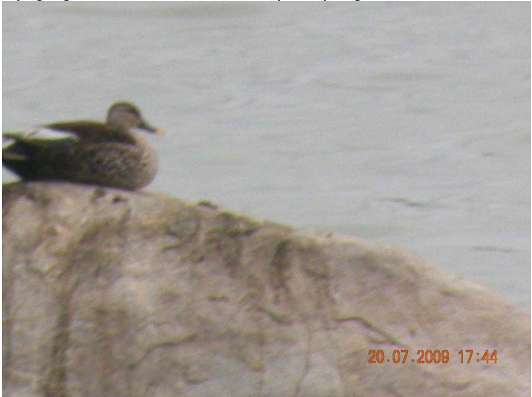
And blurs and fades!