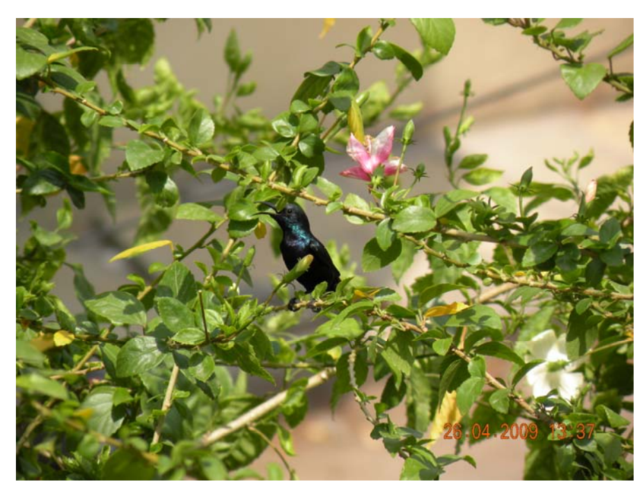
And the shine too!