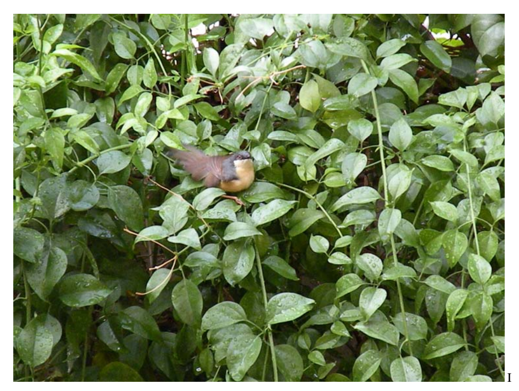
turn around oh, why are you on the gate?