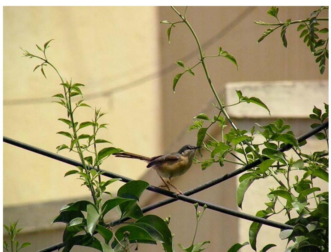
Warbler on my gate —waiting for the mate!