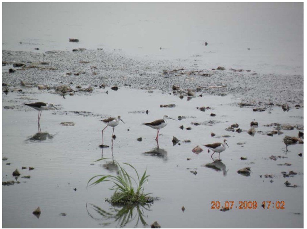
I believe in discipline – queue up please