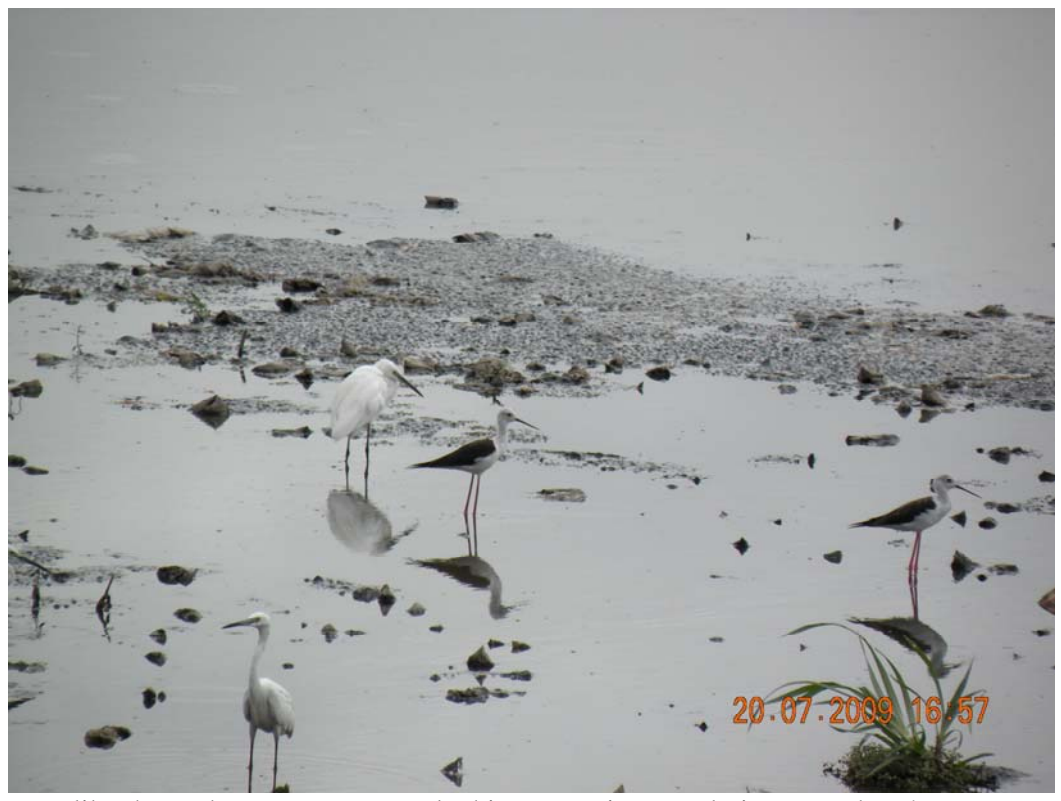
I too like them, they are so pure and white -sometimes I admit I envy them!