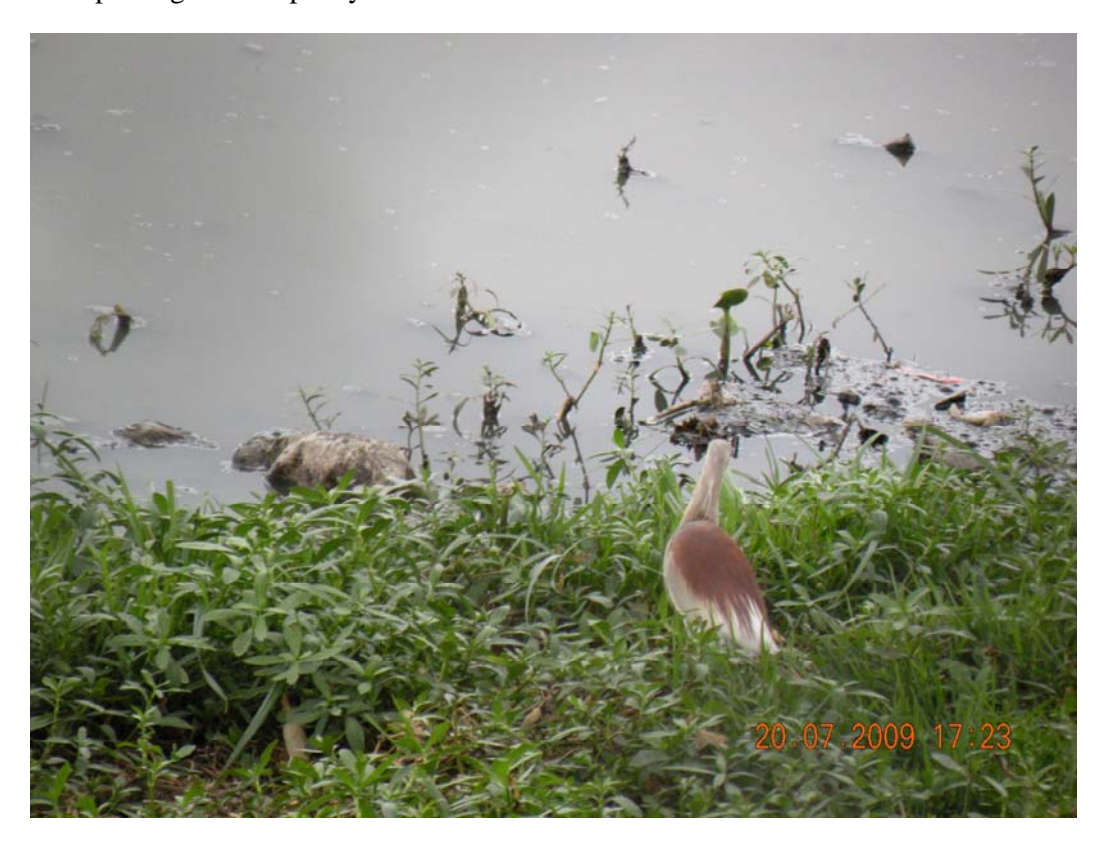
Face off a new game starts between the heron and who else -it is playing with me