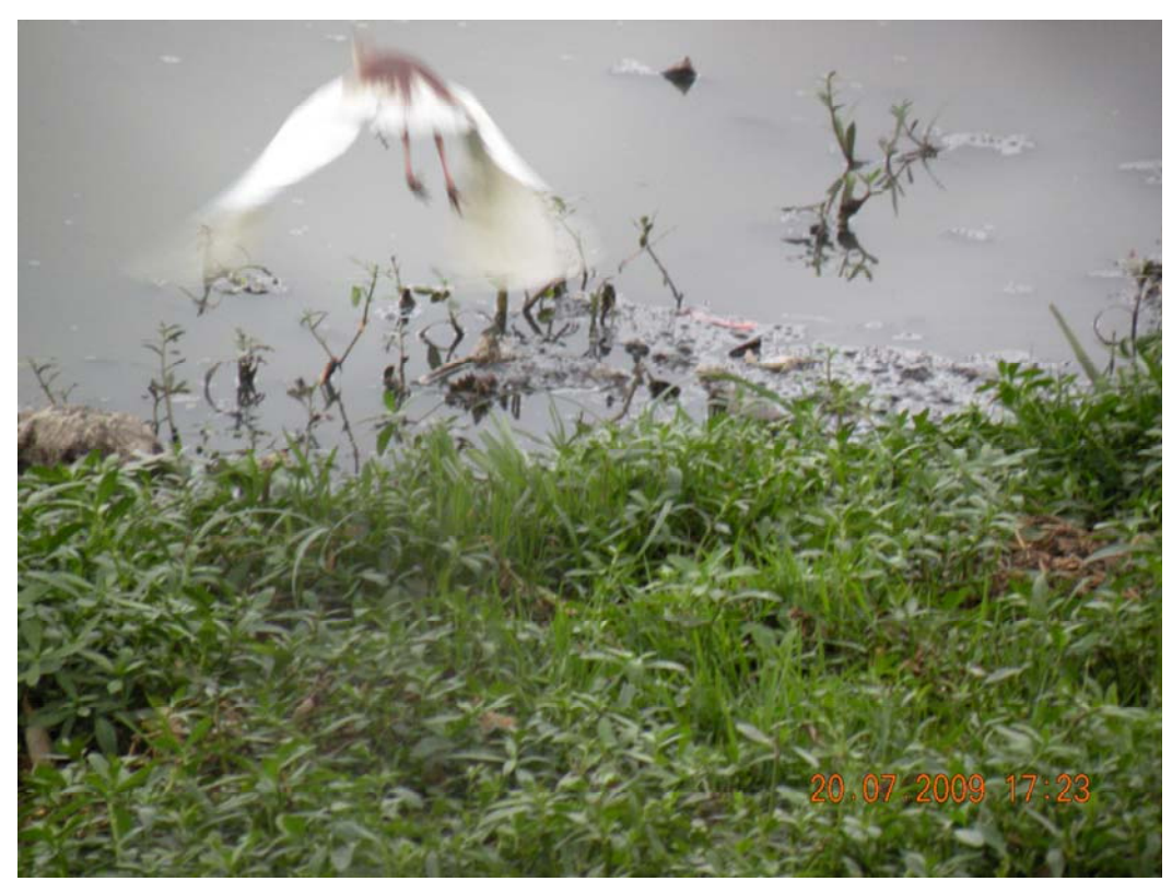
I am few seconds late and loose the game –the bird wins