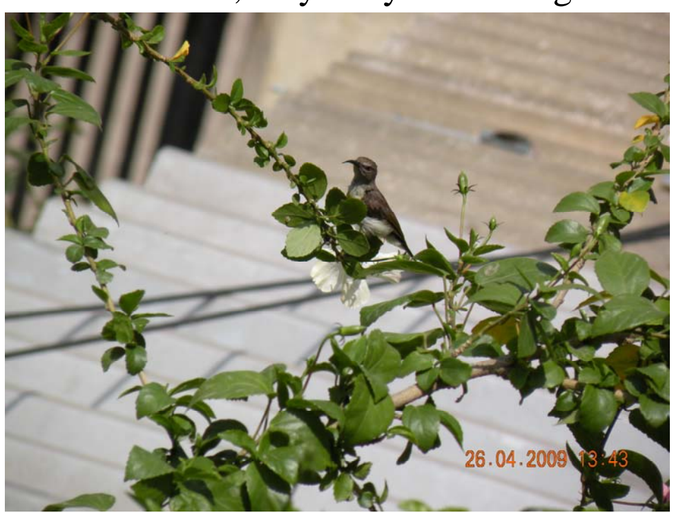
May not be very attractive but still I deserve a place in your collage! The mate of sunbird!