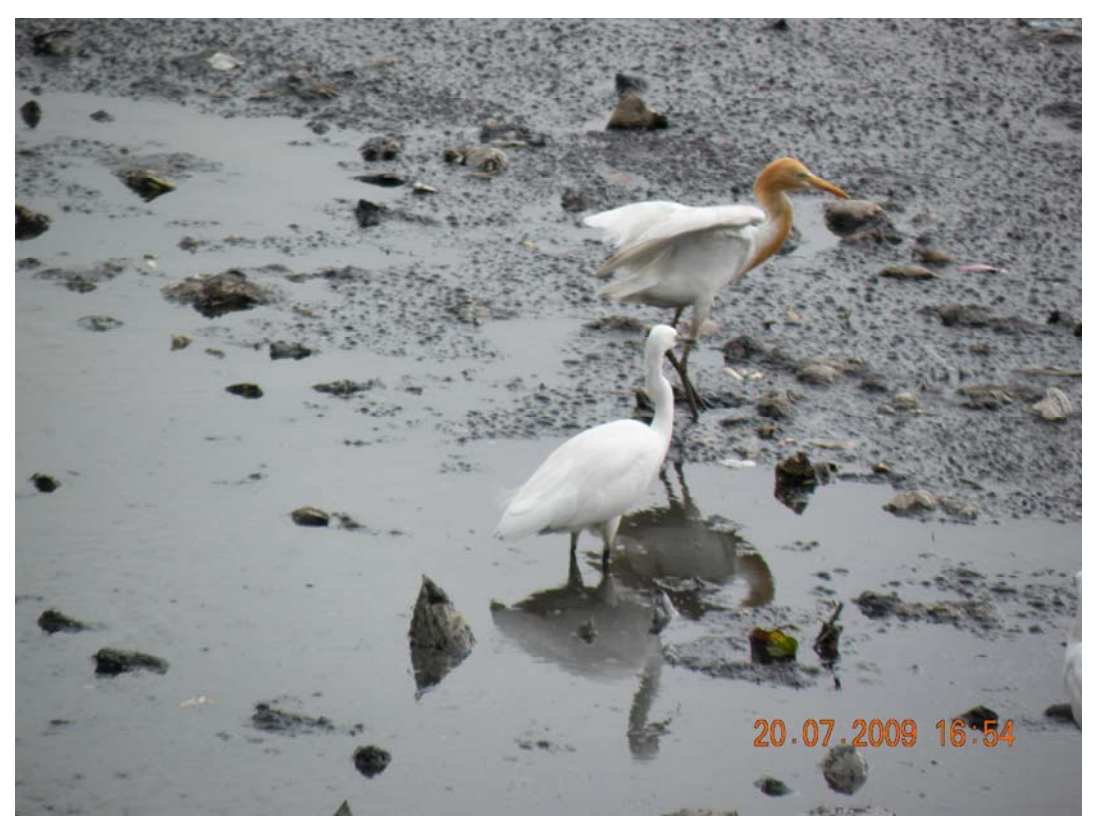
I am ready for the dance –Are you my dear?