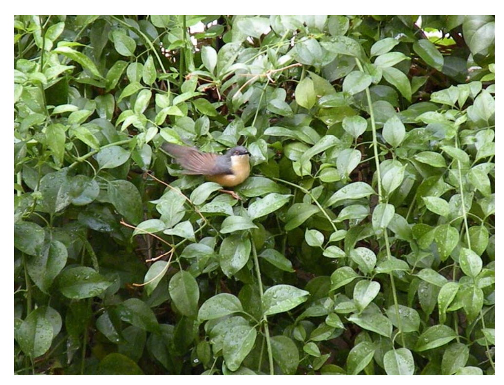
Here I am where are you?