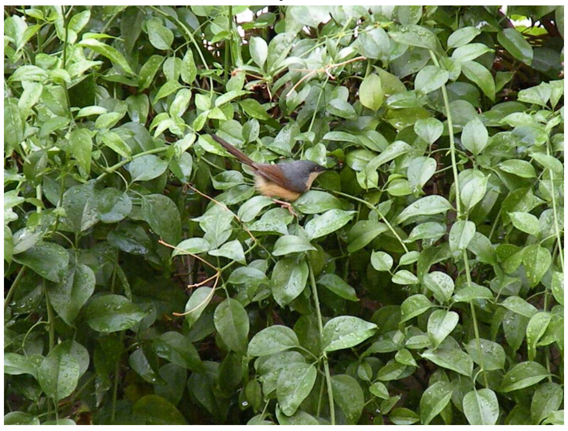
I look for you to the right