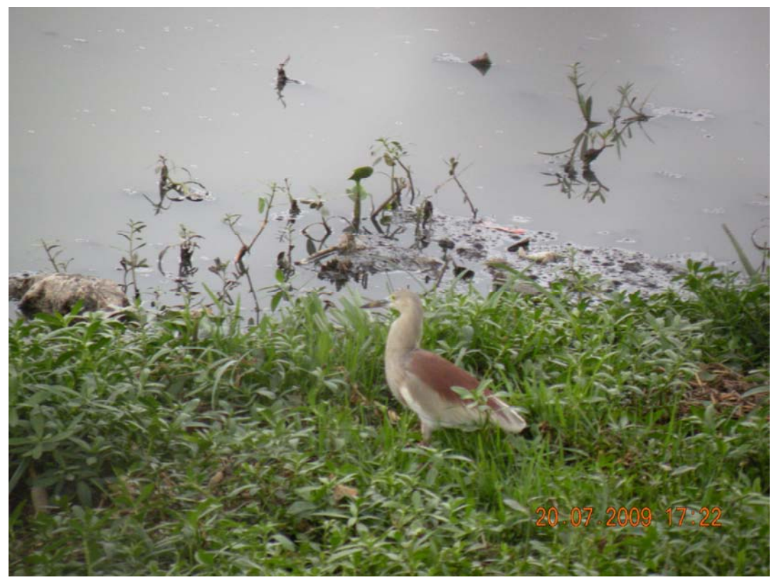
Rare plumage of this paddy bird –the heron