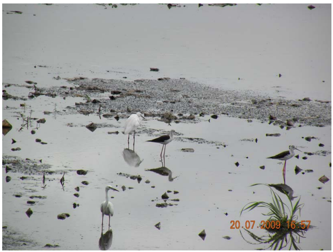
I like my friends though they are black, have pink and are only partly white; so unlike me, but my beak agrees and equates!