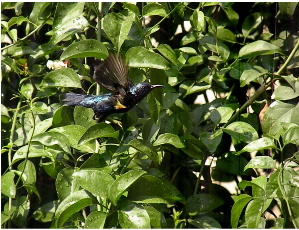
The sunbird loves the rain!