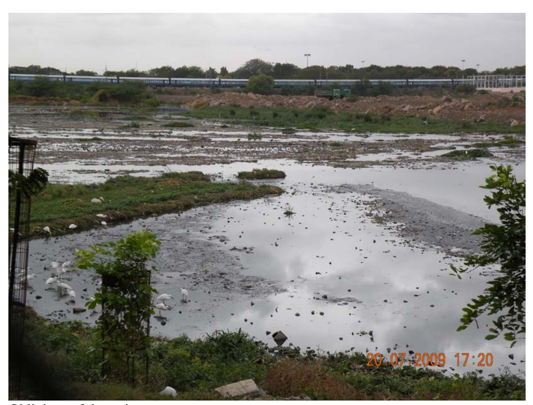
Oblivious of the train