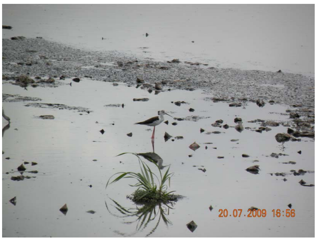
I am very tall -Only my shadow can match me