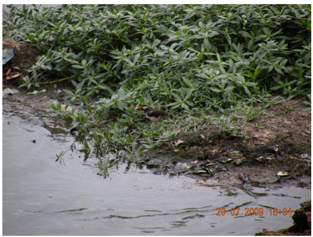
Bank Myna emerges –Just to shows off the brick red tone?