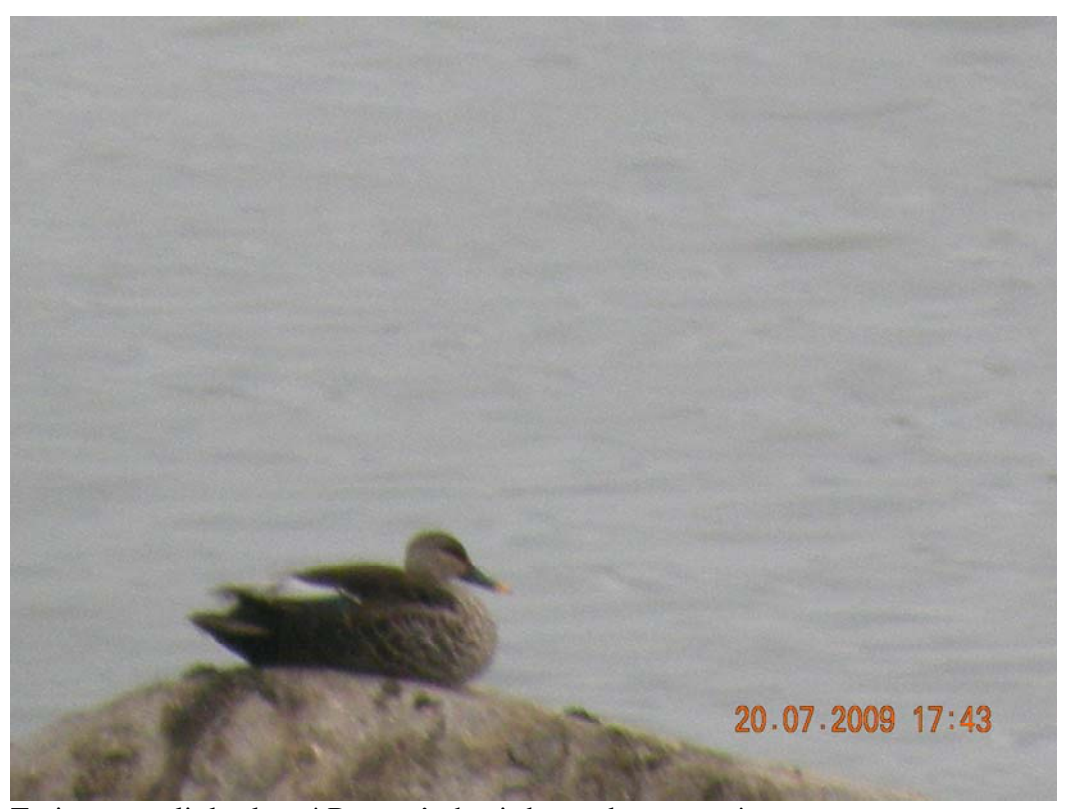
Trying to get little closer! But can't that is beyond my range!