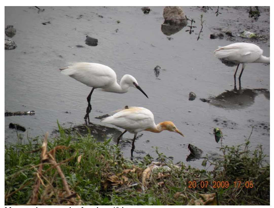
My mate dresses up, but I am beautiful too