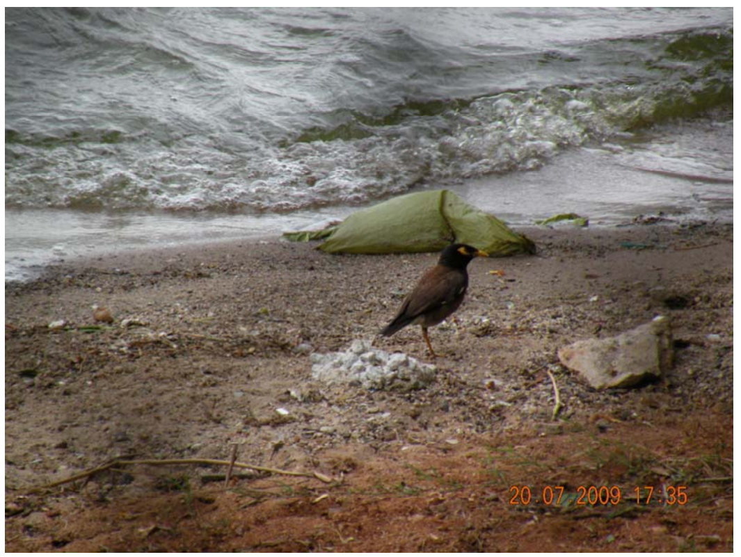
Myna: What is happening here? Every surging wave brings plastic and shreds of clothes.