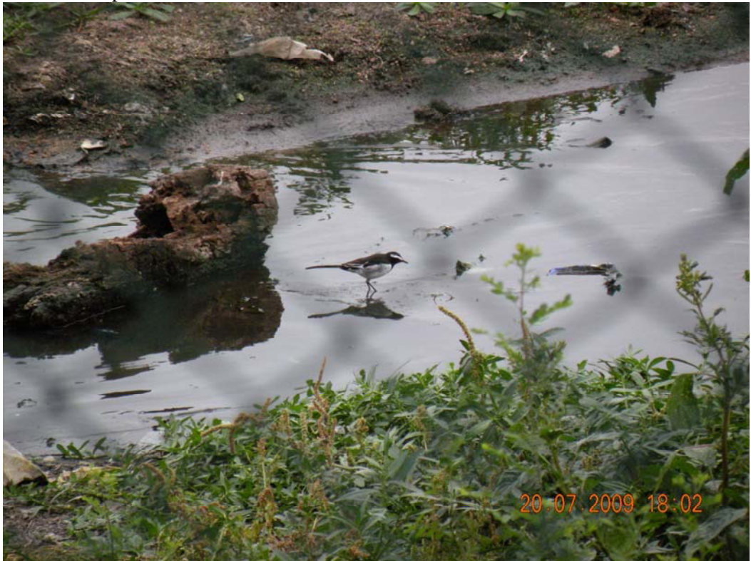
Wagtail No time to really wag!