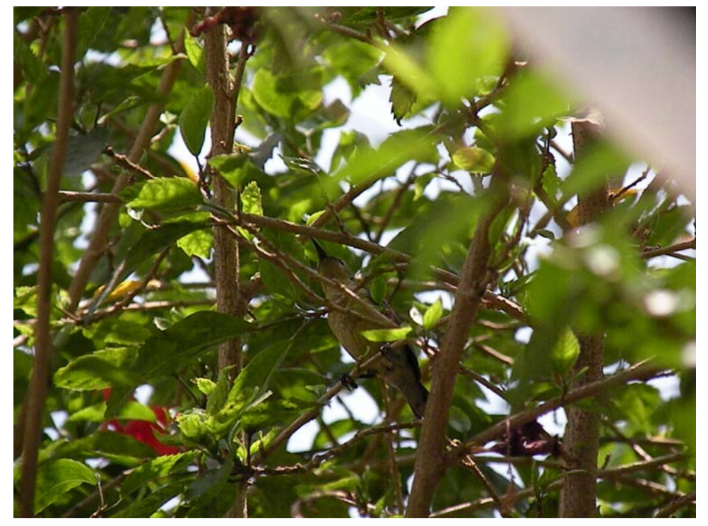
Green - not far from the first shade of the rainbow

After green – find the little yellow in the green and you would spot the bird