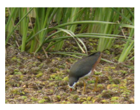
Rare in city -wears a cool coat!