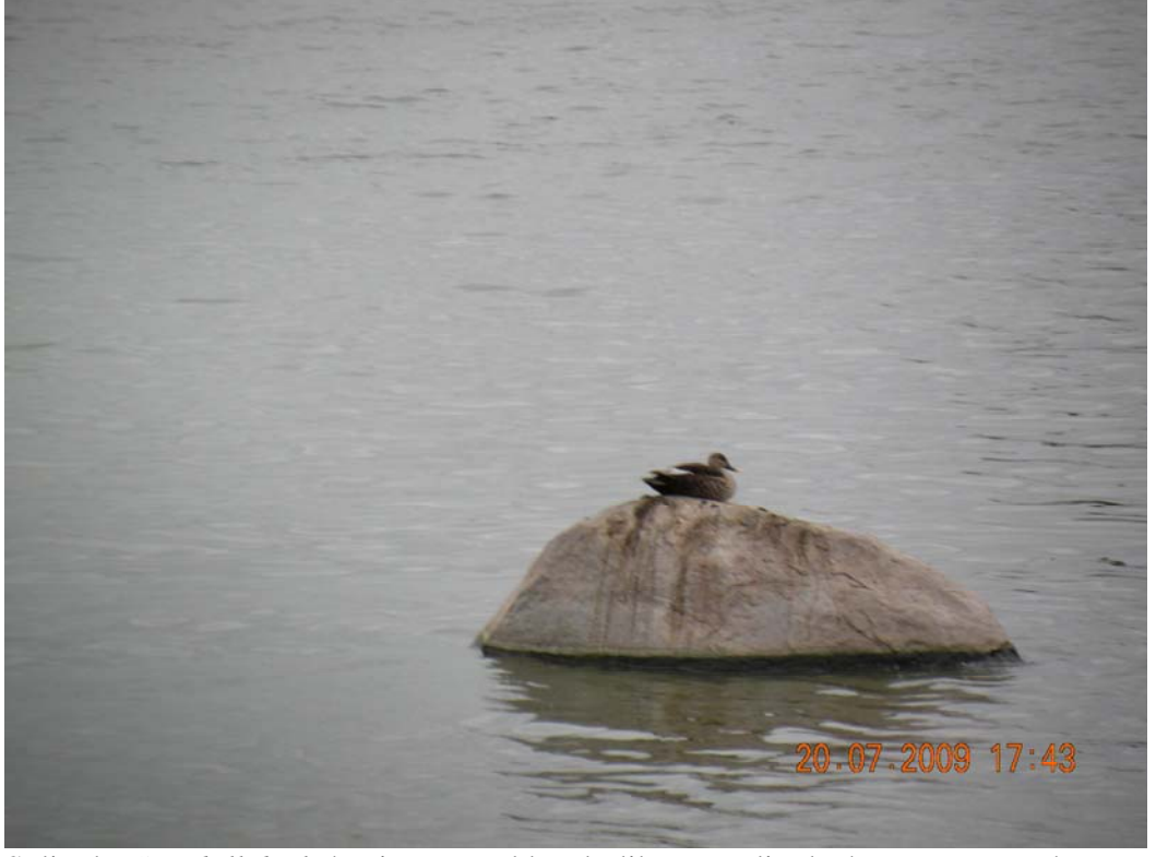
Solitude: Spot bill duck that is my world and I like my solitude there was enough romance –I am busy with family ways.