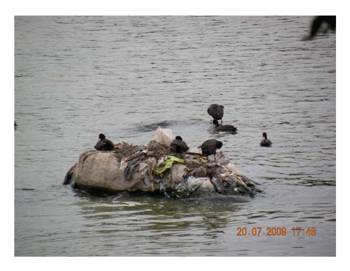
Waste: Lap it and reuse it? Coots on rocky small island their home —pile up rags and plastics for comfort—View from the road leading to Sanjeevaiah Park. Are our industrials ready to learn anything? Is the man on the move, who stop here to enjoy the breeze ready to learn?

Coots do not lag behind when it comes to rag picking.